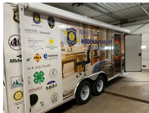
Inside and Outside of Hidden in Plain Sight Trailer